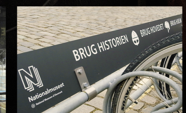
Special build bicycle rack