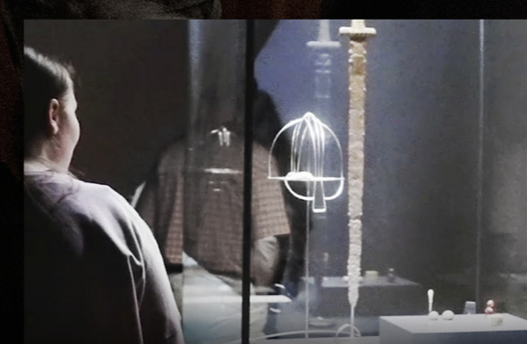
Part of a Viking exhibition at The National Museum of Denmark