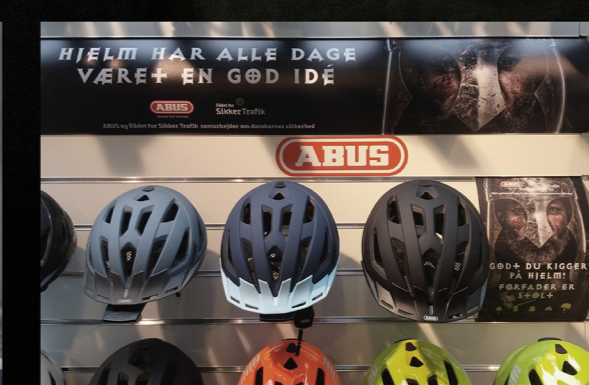
POS in bicycle shops